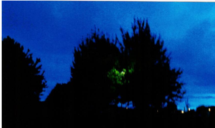
Trees obscuring a street light

Where trees are located on private land, the land owner will be afforded the opportunity to carry out the necessary work. Alternatively with the owner's permission, the County Council will carry out the work and any costs will be recharged. Where the owner's consent cannot be obtained the Council will invoke regulatory procedures to deal with the issue.