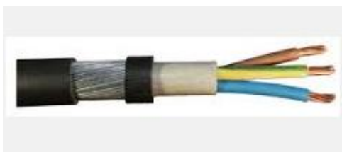
3 core SWA cable with standard Brown, Blue and Green/Yellow conductors

In the event that the local DNO is unable to provide a direct service connection to all street lighting and illuminated traffic signs, an alternative private, single phase cable may be used.