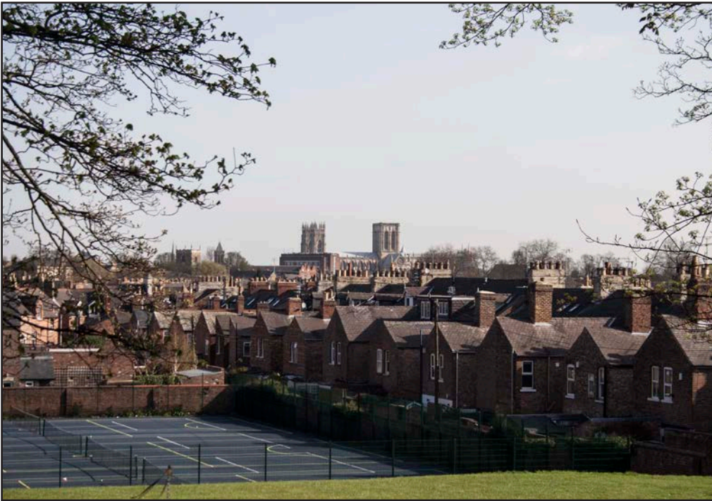
View from the grounds of Millthorpe Secondary School, one of the rare areas of relatively high ground in York.