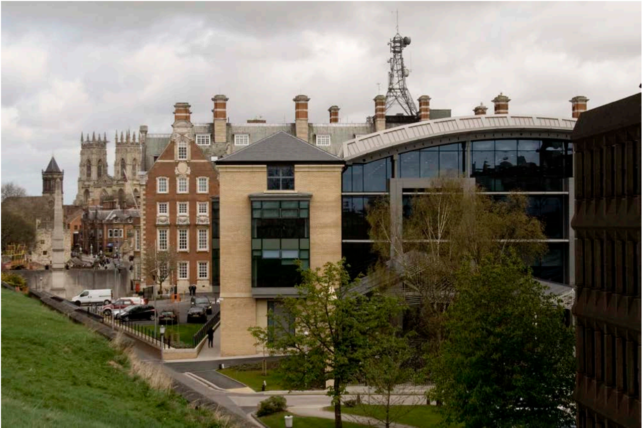
The Minster from the city wall with the converted 1840s railway station in the foreground