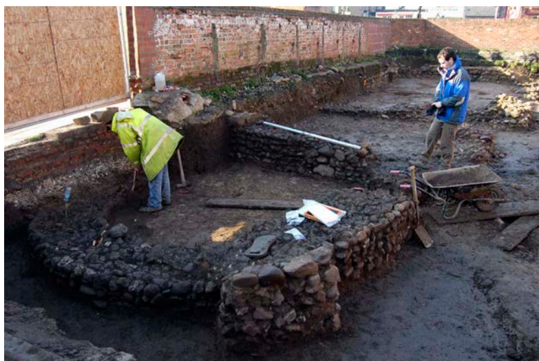
Foundations of the medieval church of All Saint's, Fishergate.

6.28 Archaeological deposits can be found throughout the City of York area. All areas within the City of York have the potential to preserve archaeological features and deposits. Detailed characterisation of the archaeological features and deposits within this area is a complex process beyond the scope of this paper. This section therefore attempts to provide simple, high-level character statements which can be used to assess the impact of Local Plan policy statements.