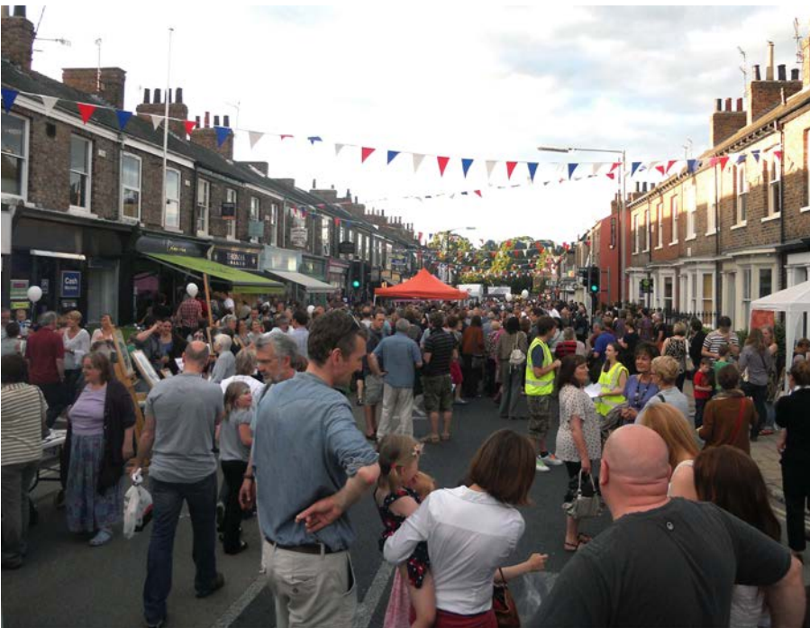
The thriving shopping centre of Bishopthorpe Road during an annual street party.