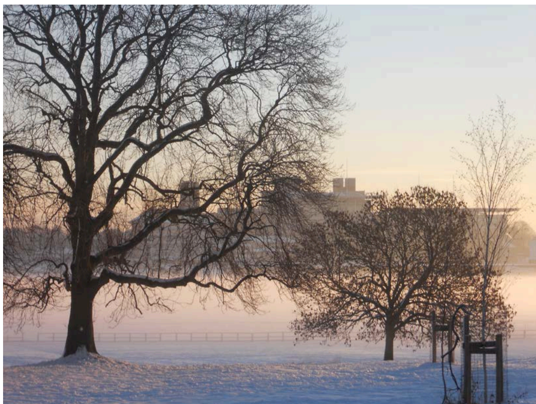
The Knavesmire, part of Micklegate Stray and an important part of York's green infrastructure.

6.30 Its relevance lies in the conglomeration of layers and relics of old landscapes, in part conserved through time by continuous administration, absence of development, and centuries of traditional management. It is the combination of the various elements such as the lngs and strays that provides York's unique make up. The natural environment is significant in its concentrated collection of a variety of examples of historically managed landscapes, represented for example by wild flower meadows, lowland heath, valley fen, strip fields, veteran orchard trees, species-rich hedgerows. Many of these otherwise isolated remnant landscapes link up with other open spaces resulting for example from our industrial or war time past, to form often accessible tracts of subtly diverse landscapes; thus the landscape/natural heritage is much greater than the sum of its parts.