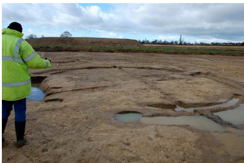
Iron Age round house ditches at Campus 3, Heslington.