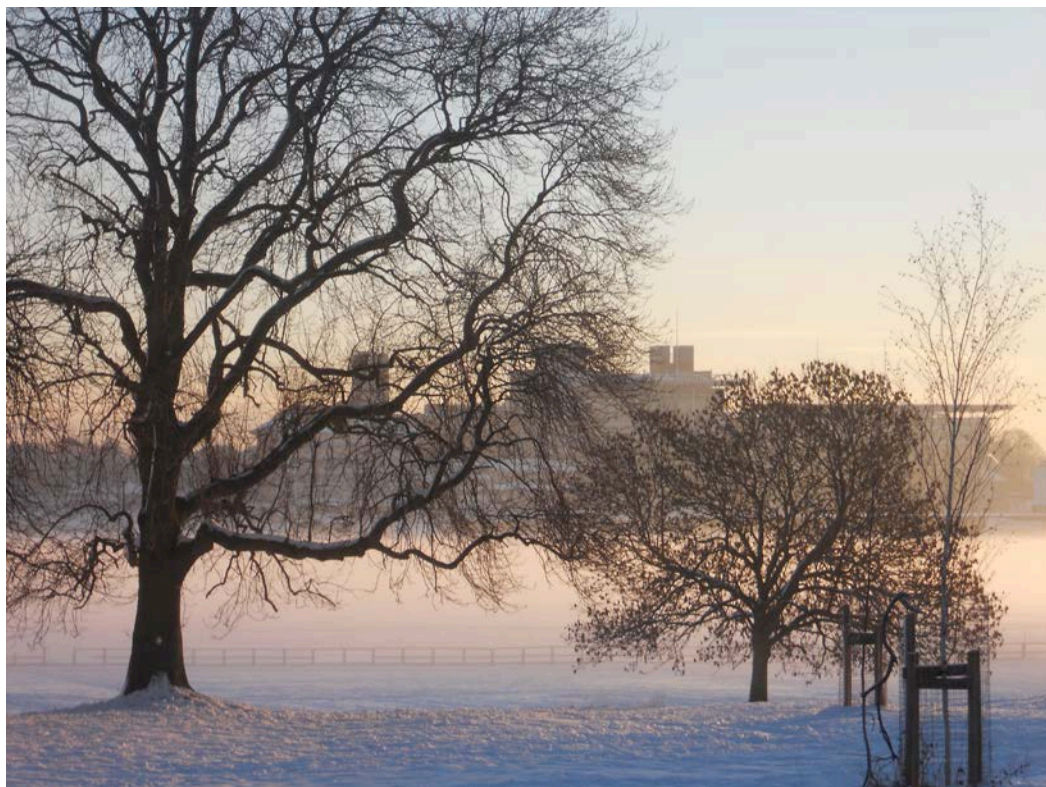
The Knavesmire, part of Micklegate Stray and an important part of York's green infrastructure.

6.30 Its relevance lies in the conglomeration of layers and relics of old landscapes, in part conserved through time by continuous administration, absence of development, and centuries of traditional management. It is the combination of the various elements such as the lngs and strays that provides York's unique make up. The natural environment is significant in its concentrated collection of a variety of examples of historically managed landscapes, represented for example by wild flower meadows, lowland heath, valley fen, strip fields, veteran orchard trees, species-rich hedgerows. Many of these otherwise isolated remnant landscapes link up with other open spaces resulting for example from our industrial or war time past, to form often accessible tracts of subtly diverse landscapes; thus the landscape/natural heritage is much greater than the sum of its parts.