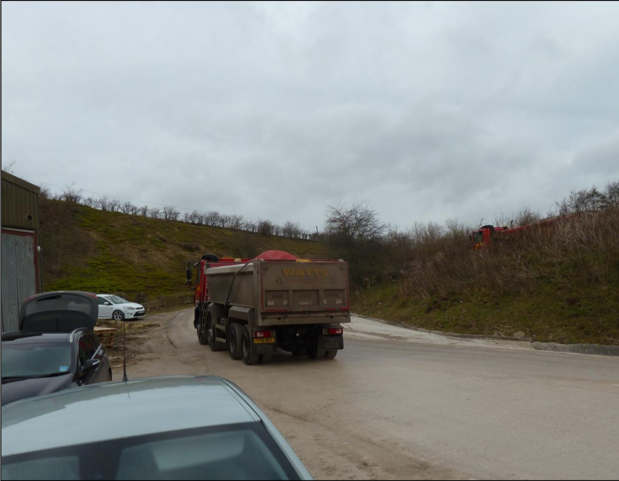
Photo 1: Sheeted wagon observed leaving the site on the day of the visit.