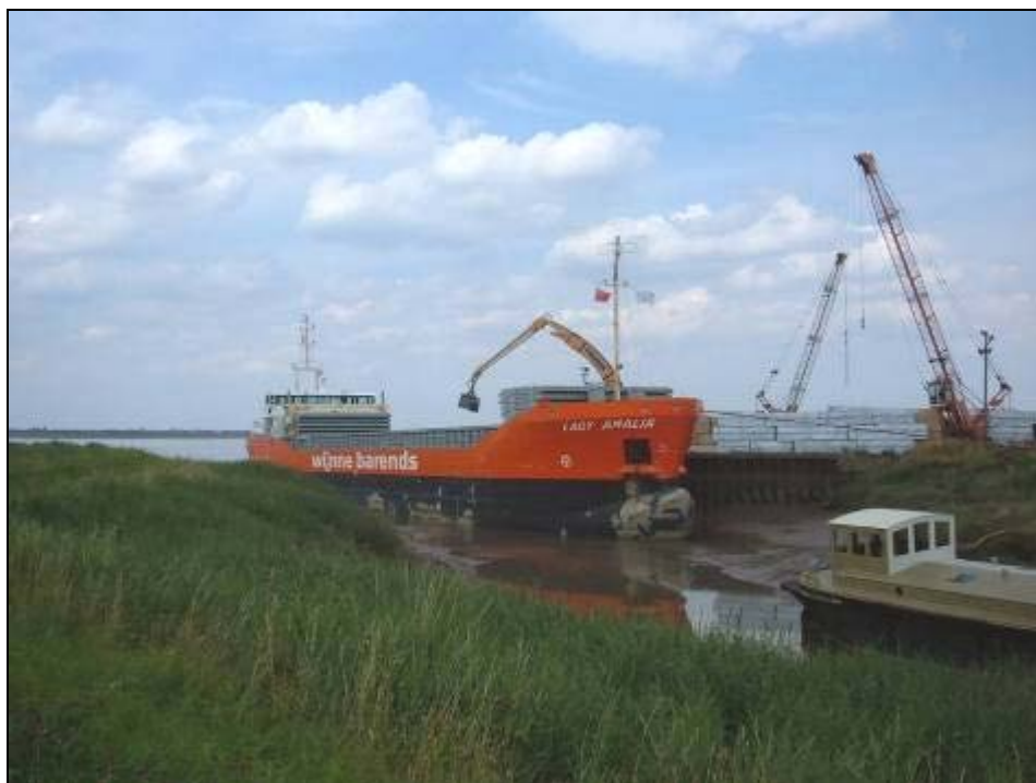
Photograph 11: Barrow Haven Wharf on the south side of the Humber, vessels may rest on the mud during loading and unloading.