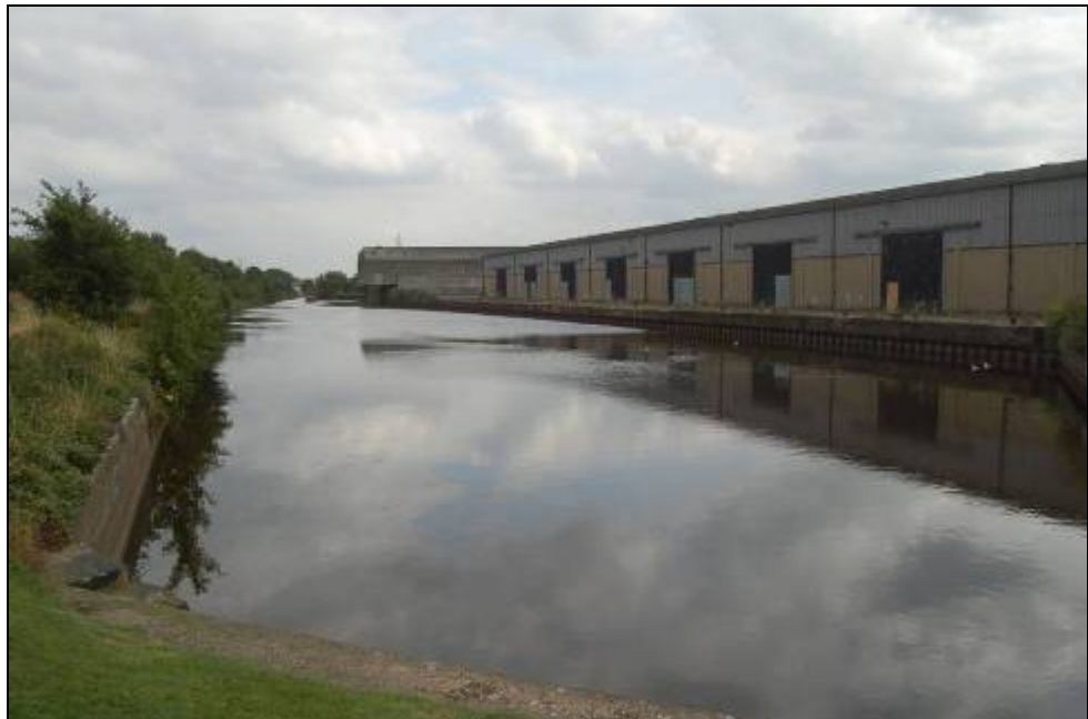
Photograph 13: Canal wharves on the Aire and Calder Navigation, Knothrop Cut, Leeds (URS 2013).