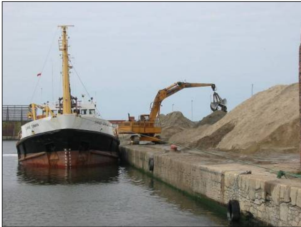
Photograph 5: The small dredger Sand Swan (1500 tonne capacity, 5m draft) unloading concreting sand at Mersey Sand Supplies aggregate wharf, East Bramley Moore Dock Liverpool 2005.