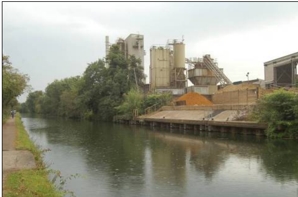
Photograph 7: West Drayton Depot a canal side aggregate wharf with adjoining concrete batching and asphalt plant, North London. The depot is also rail linked. (URS 2013).