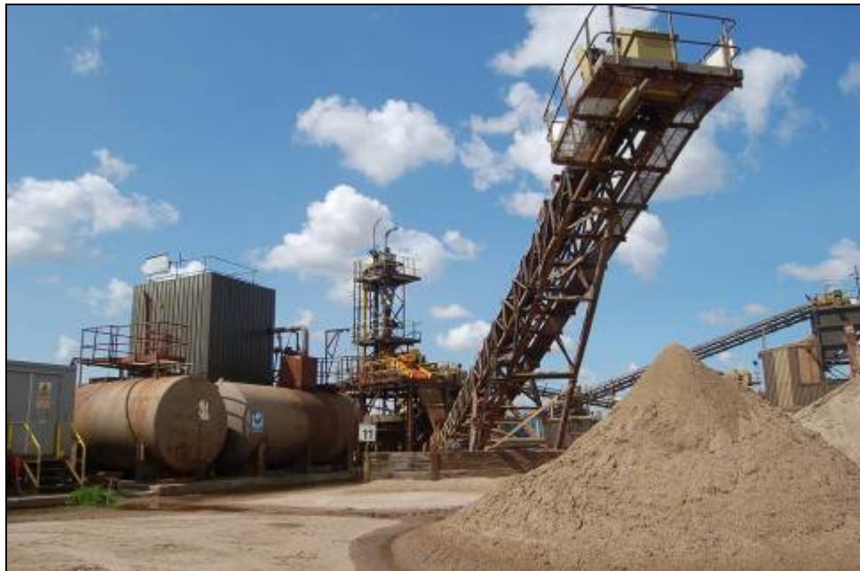
Photograph 3: Sand Processing at Alexandra Dock Humber Sand and Gravel Ltd. (URS 2013)