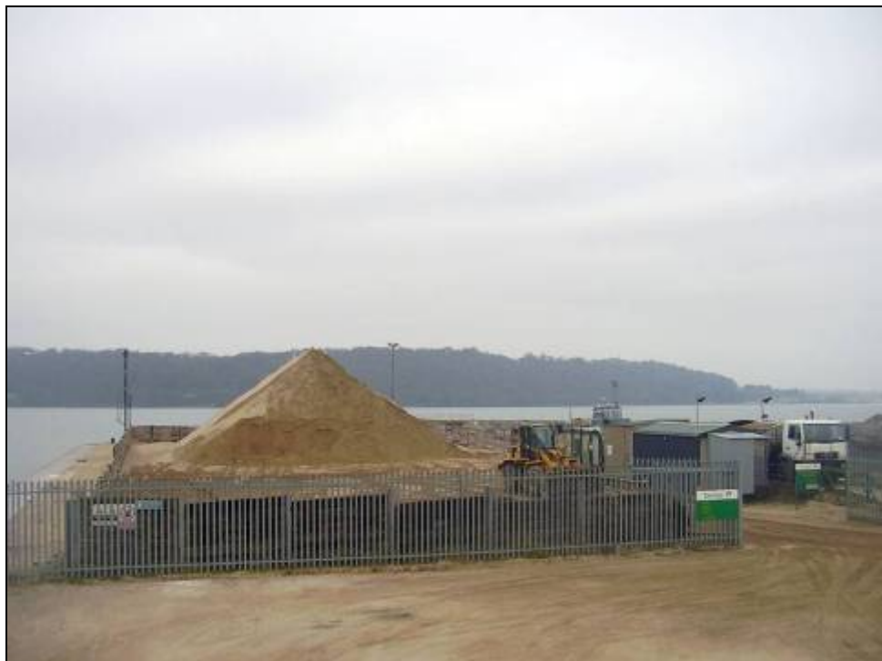
Photograph 4: A very small scale aggregate (sand only) wharf at Port Penrhyn, Bangor 2005.