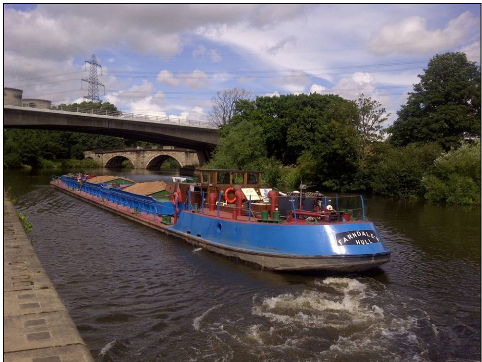
Photograph 15: Gravel barge 'Farndale H' owned by Branford Barge Owners about to pass under the A1 on the Aire and Calder with the last delivery to Whitwood Wharf in 2013 (see Photograph 6. (Source www.hulldockbargeworld.com , originator Maik Brown).