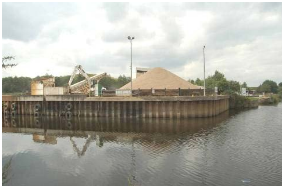
Photograph 6: Whitwood Aggregate Wharf, near Castleford on the Aire and Calder (URS 2013). See also Photograph 16.