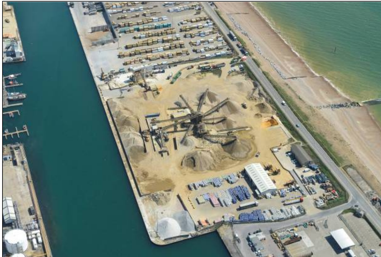
Photograph 8: Tarmac Marine Dredging's large scale aggregate wharf Shoreham East Port.