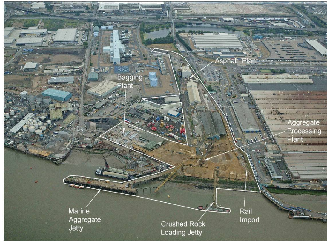
Photograph 9: Hanson UK Dagenham Marine Wharf and Rail Depot a large scale multi-modal facility on the Thames.