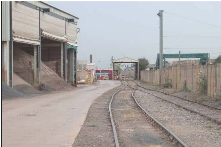
Photograph 10: A typical aggregate depot rail siding with offload station. A receiving hopper is positioned under the small two sided structure positioned over the railway line. Rail waggons self-discharge into the hopper and a conveyor positioned underneath transfers the aggregate to the storage shed on the left. Hanson's West Drayton Depot, North London (URS 2013).