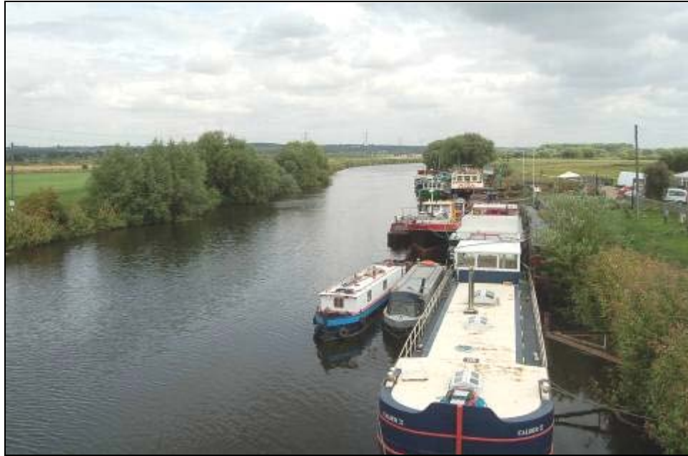
Photograph 12: The Aire and Calder Navigation at a boatyard north of Castleford, illustrating the size of a commercial barge alongside pleasure craft (URS 2013).