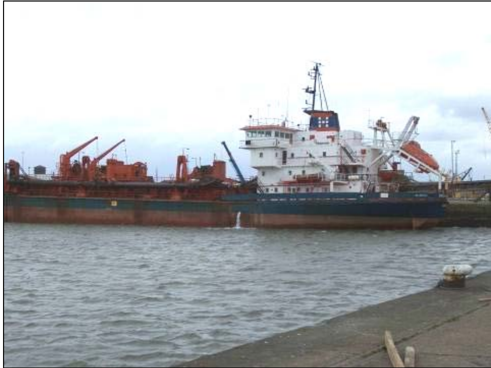
Photograph 1: Hanson dredger Arco Beck tied up at Alexandra Dock, Port of Hull. The ship has a reported load capacity of 4900 tonnes and draft of 6.51m