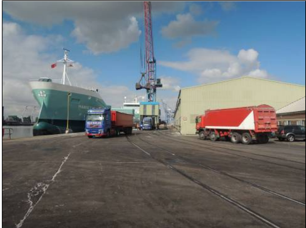
Photograph 14: Immingham docks, wharf with rail sidings (URS 2013)