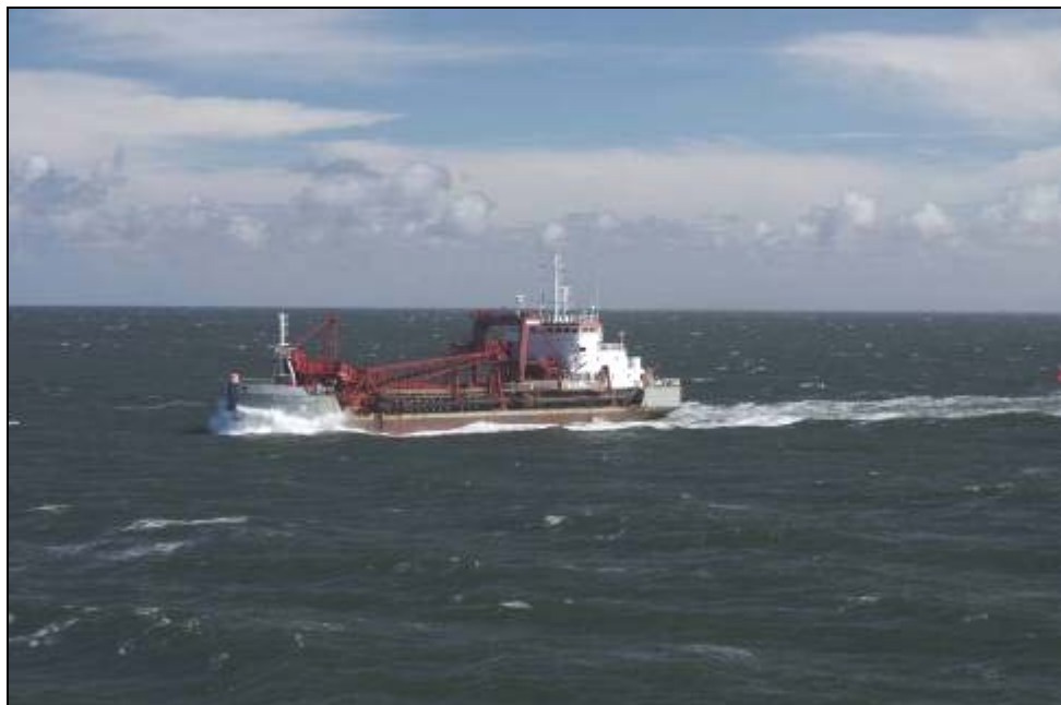
Photograph 8: Tarmac Marine Dredging's 'City of Cardiff' a medium sized dredger with 5.1m draft and cargo capacity of 2500 tonnes, here in Liverpool Bay (C Nicoll personal collection 2013).