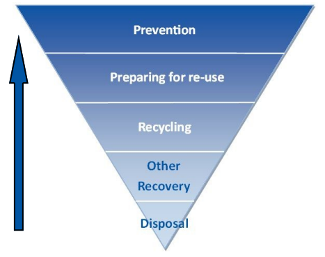
Figure 1: Waste hierarchy

We will also need to consider how the Joint Plan can meet the objectives of national waste planning policy and legislation. Of particular importance is helping to deal with waste more sustainably and moving management methods further up the 'waste hierarchy'.