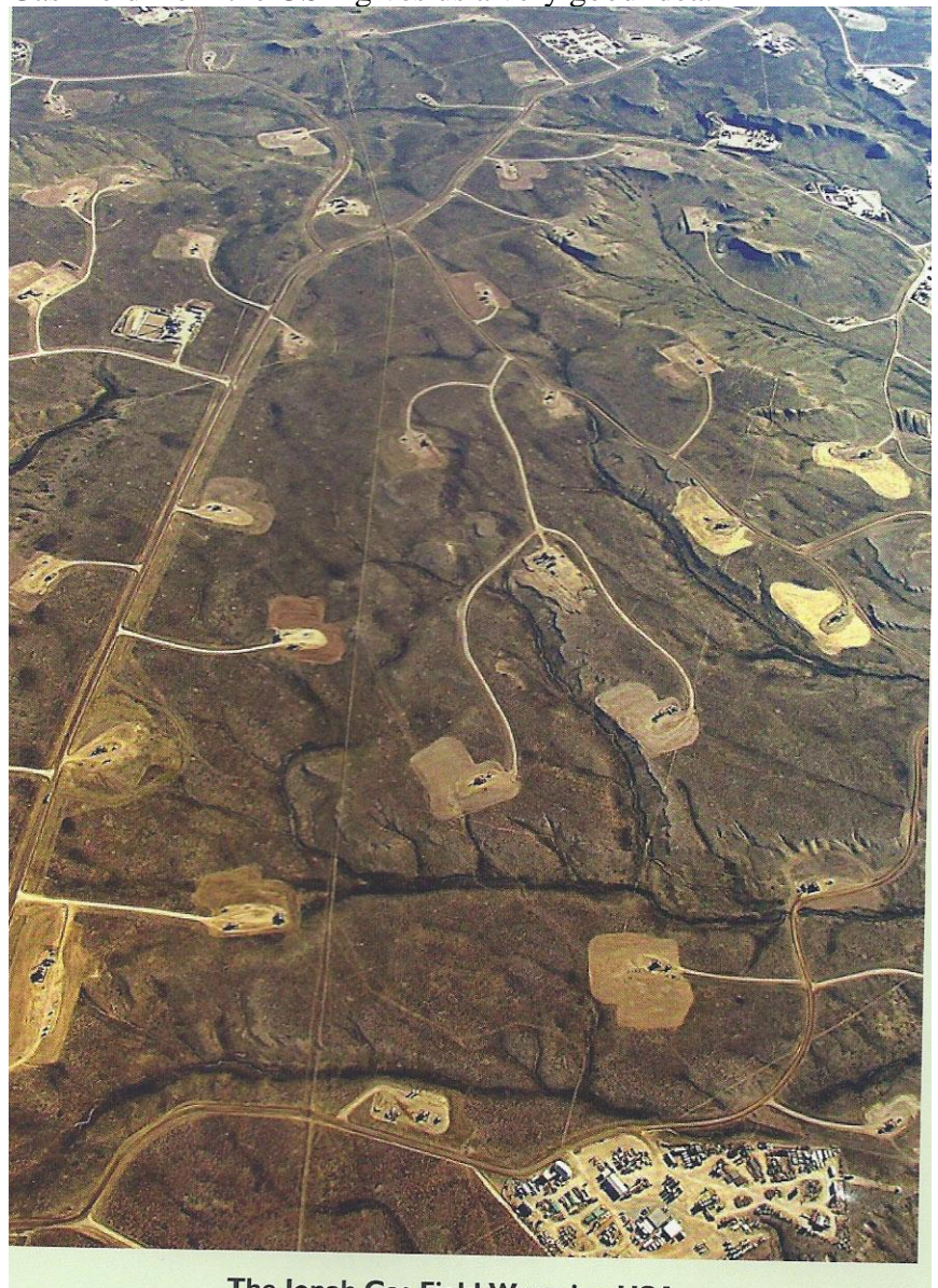
The Jonah Gas Field Wyoming USA

Gas Field from the USA gives us a very good idea.