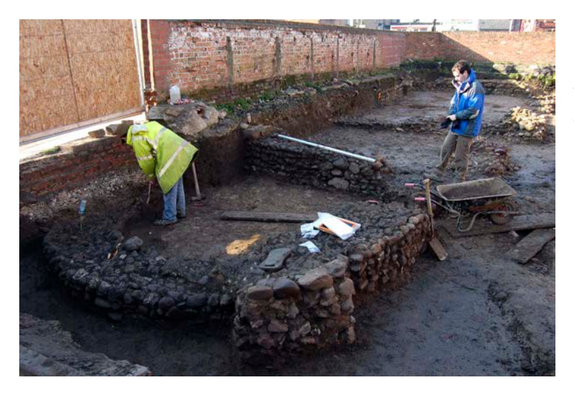
Foundations of the medieval church of All Saint's, Fishergate (photo by John Oxley).

6.28 Archaeological deposits can be found throughout the City of York area. All areas within the City of York have the potential to preserve archaeological features and deposits. Detailed characterisation of the archaeological features and deposits within this area is a complex process beyond the scope of this paper. This section therefore attempts to provide simple, high-level character statements which can be used to assess the impact of Local Plan policy statements.