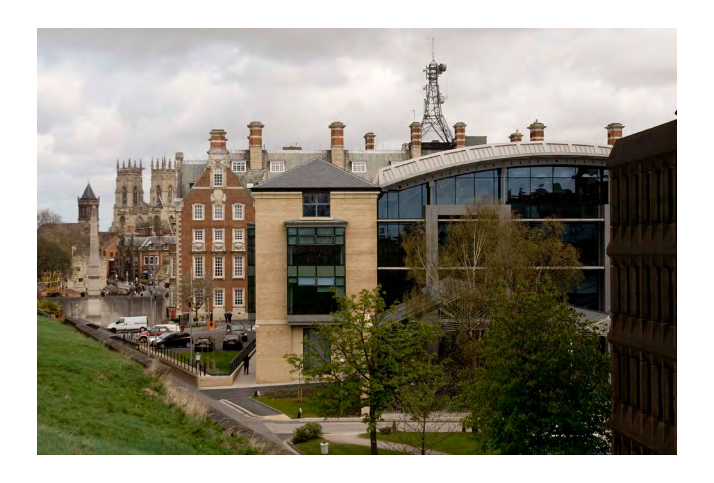
The Minster from the city wall with the converted 1840s railway station in the foreground