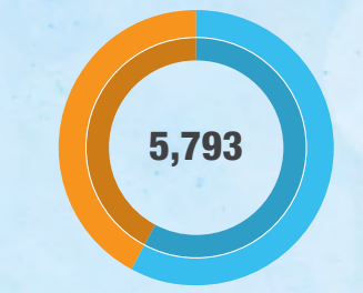
In North Yorkshire, 10,000 people are estimated to be living with dementia, but only 5,793 people have actually been diagnosed.