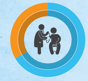
70% of people with dementia are living with at least one other long-term health condition.

There are 700,000 people believed to be living with dementia in England, but only 419,000 have actually been diagnosed.