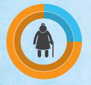
Most people living with dementia are likely to be older people, with 1 in 4 people over 85 at risk of the conditions that cause dementia.