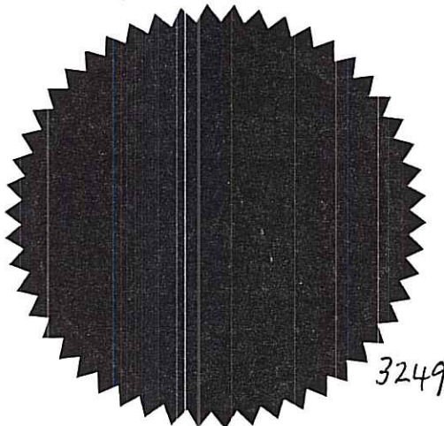
M F Turnbull Solicitor