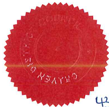
Director of Services

The Common Seal of Craven District Council was hereunto affixed in the presence of -