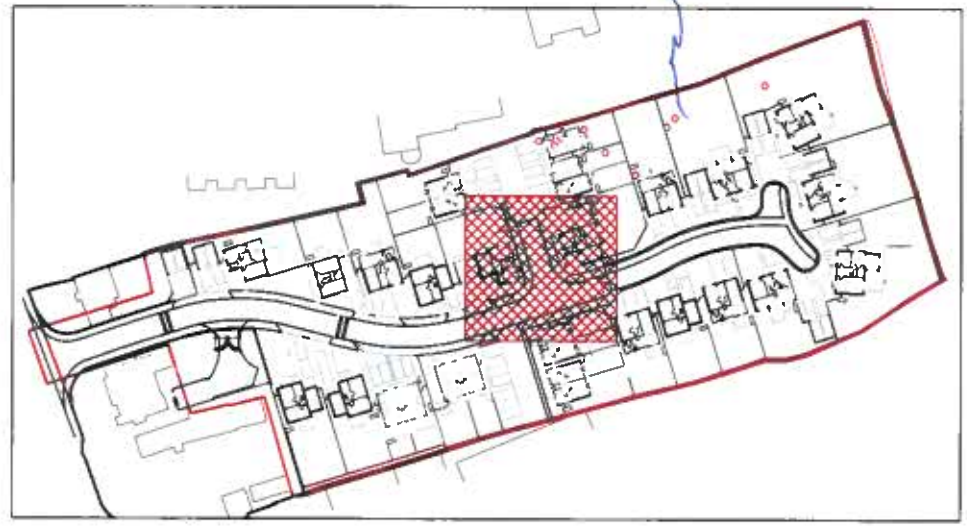
LOCATION PLAN (N.T.S)