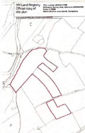
Snip from Original Application reference 322, recorded as Right Entry 5