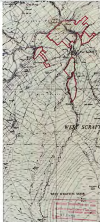
Snip from Applicants supporting Document – Land Registry Title Plan NYK517799