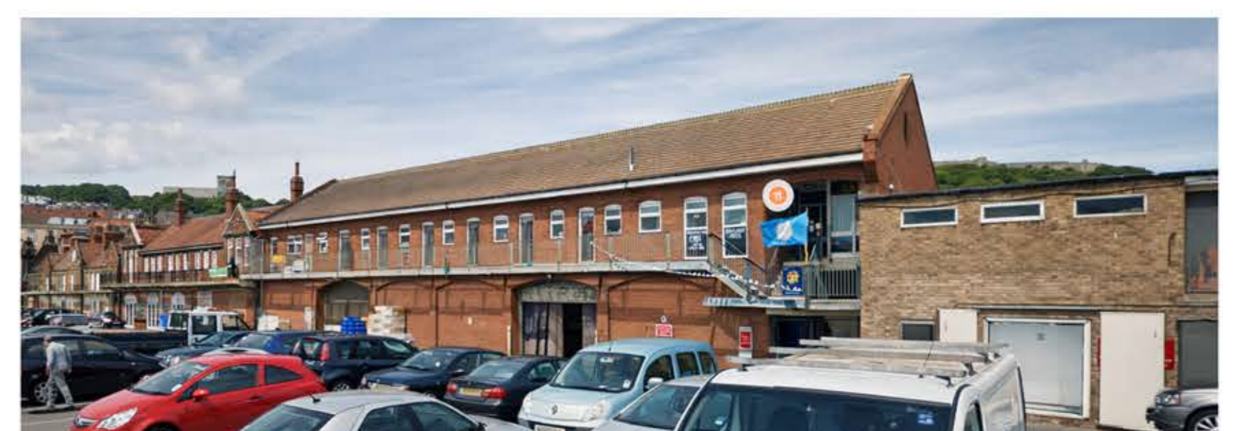
Image - South East View of Building 2 & 3