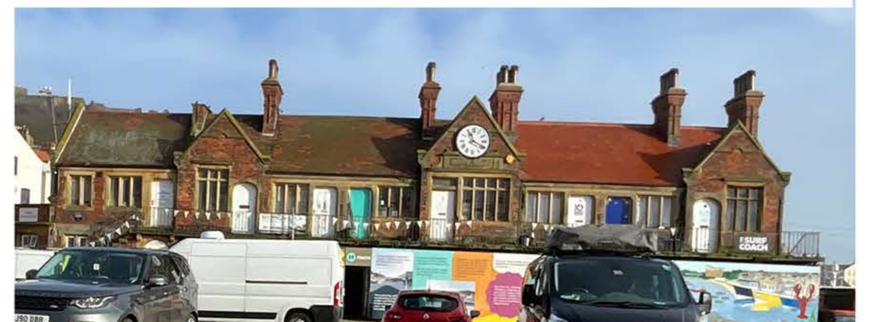
Image - North West View of Building 1