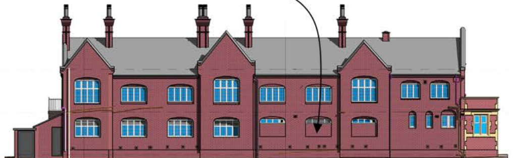
Existing North East Elevation