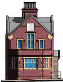
Existing North West Elevation