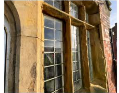
Building 1 Features - Existing weathered stone