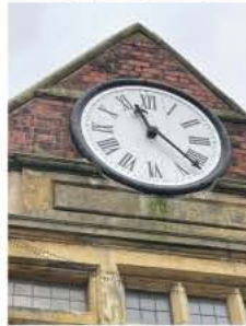
Building 1 Features - Clock