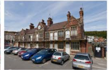
Building 1 (Google Maps 2015)