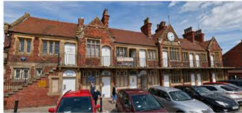
Building 1 (Google Maps 2015)