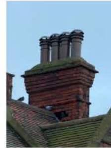
Building 1 Features - Existing chimney in disrepair