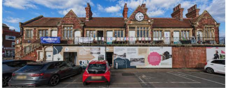
Building 1