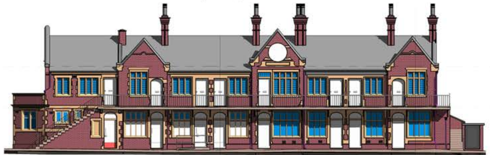
Existing South West Elevation