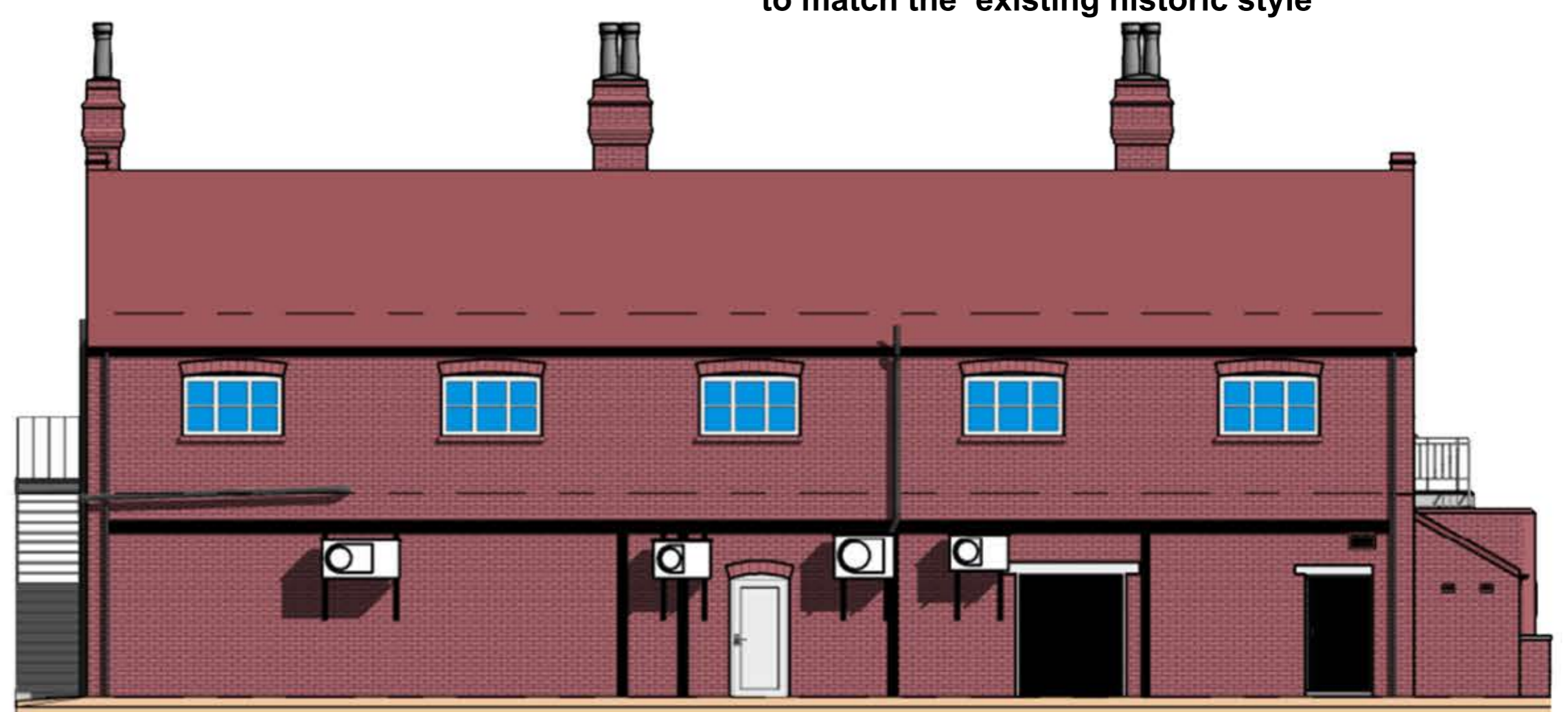
Existing North East Elevation