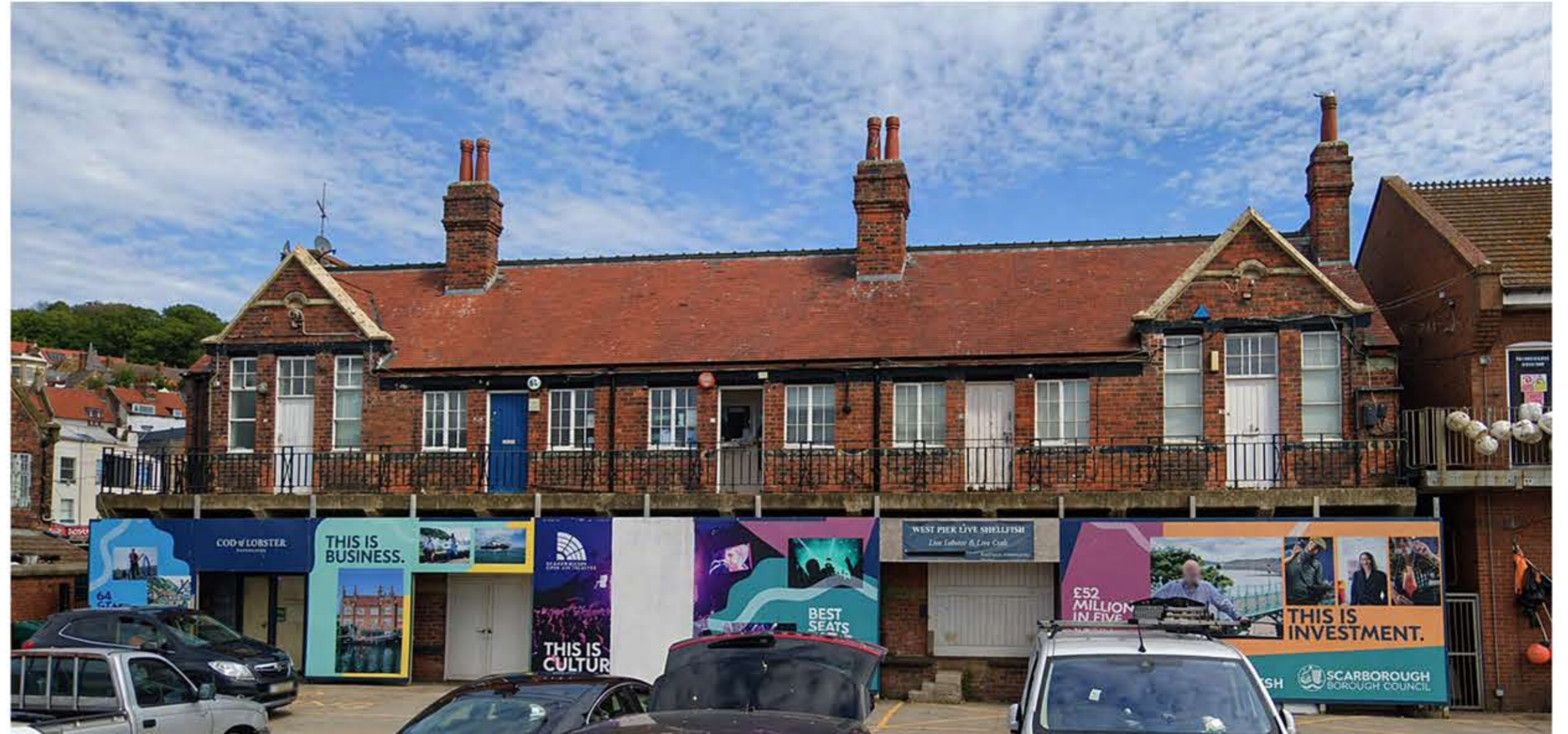
Building 2 (Google Maps 2025)