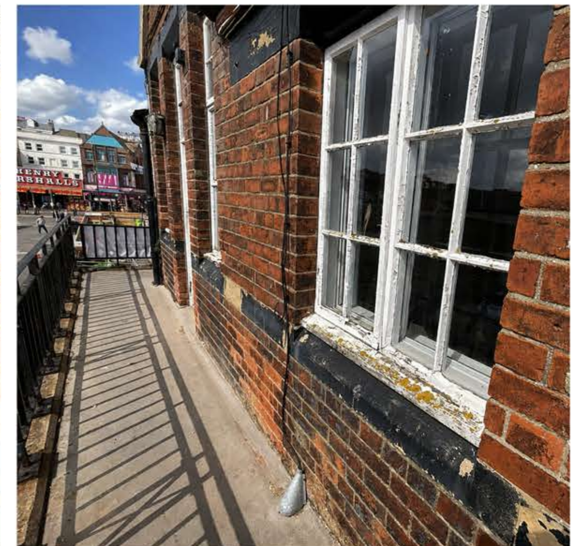
Building 2 - Existing painted black lintels