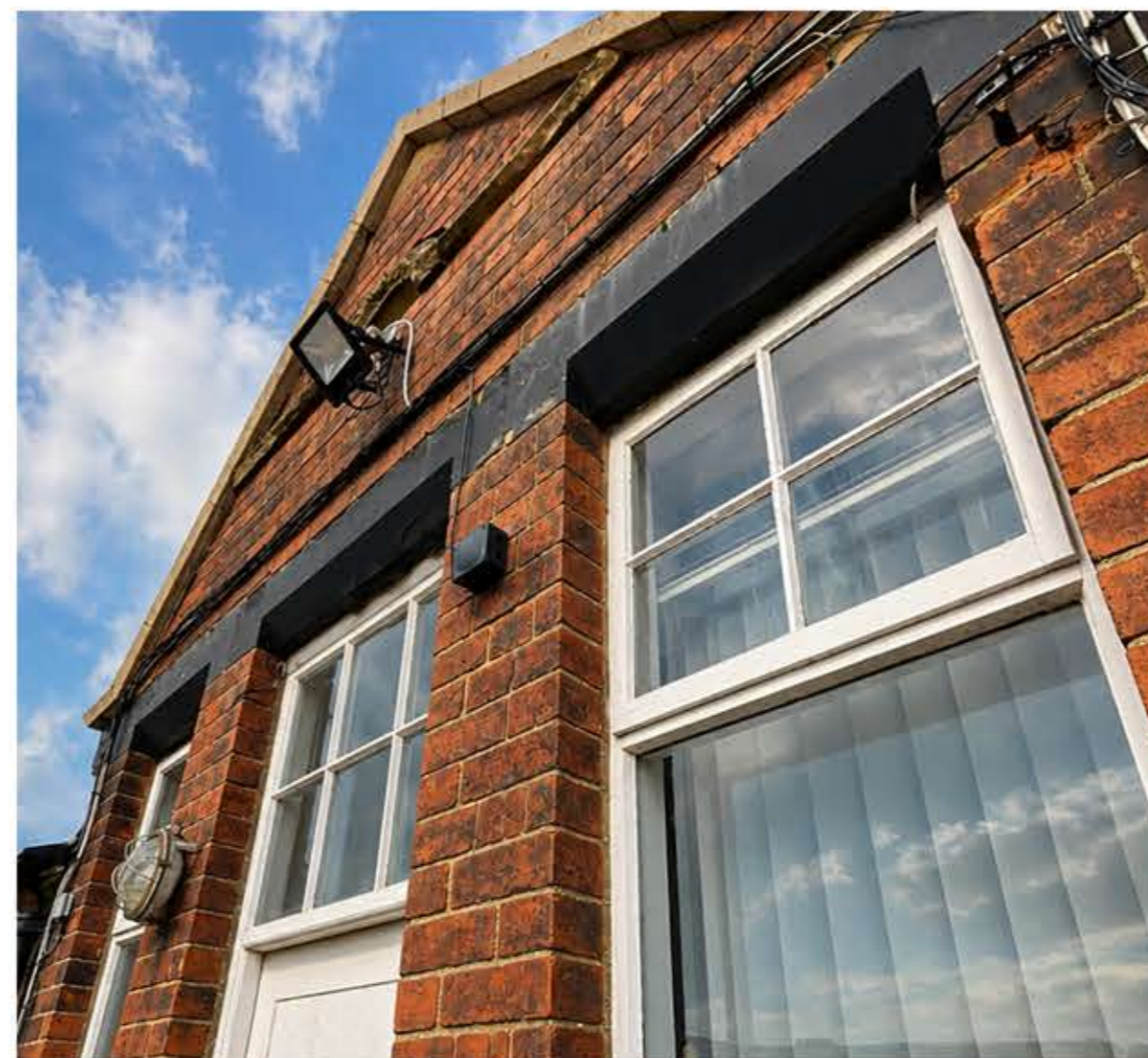
Building 2 - Existing painted black lintels