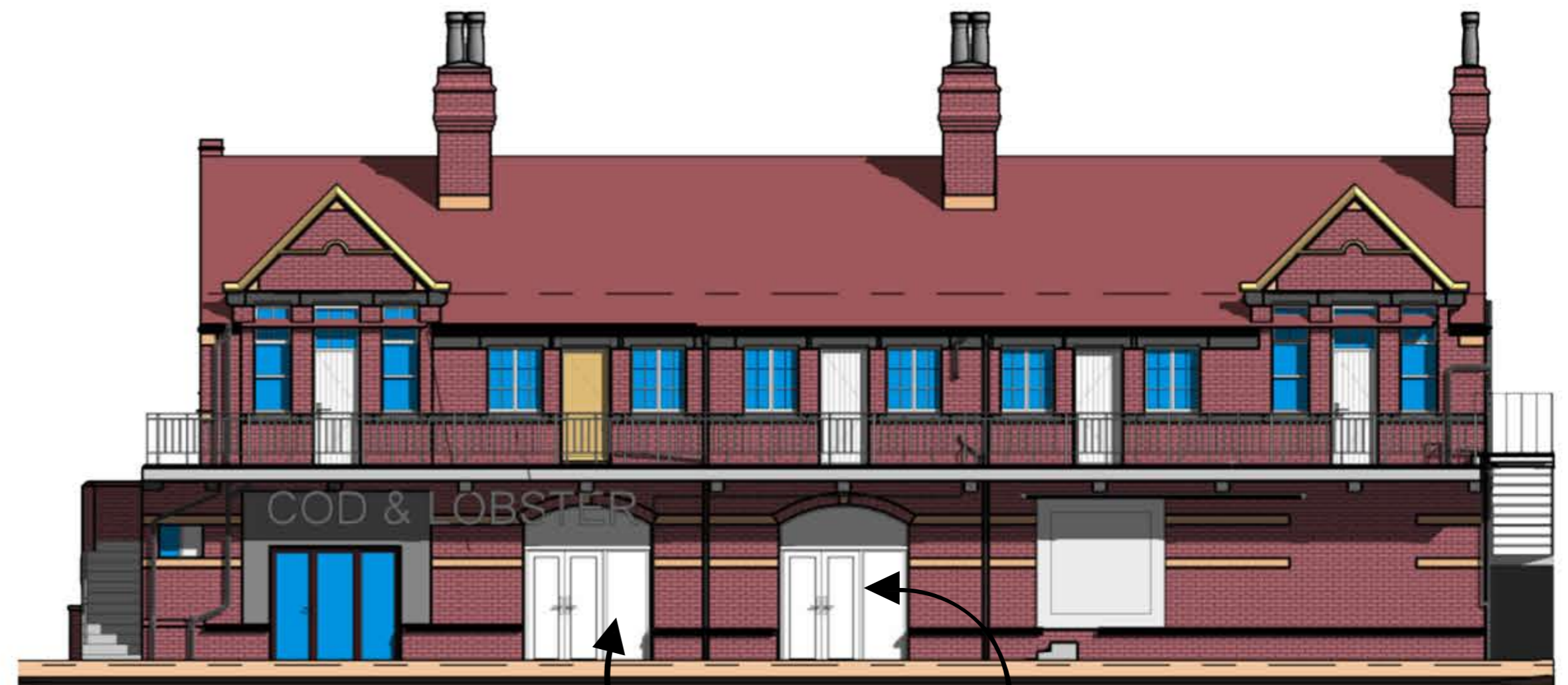
Existing South West Elevation

Existing doors to be replaced to match the existing historic style