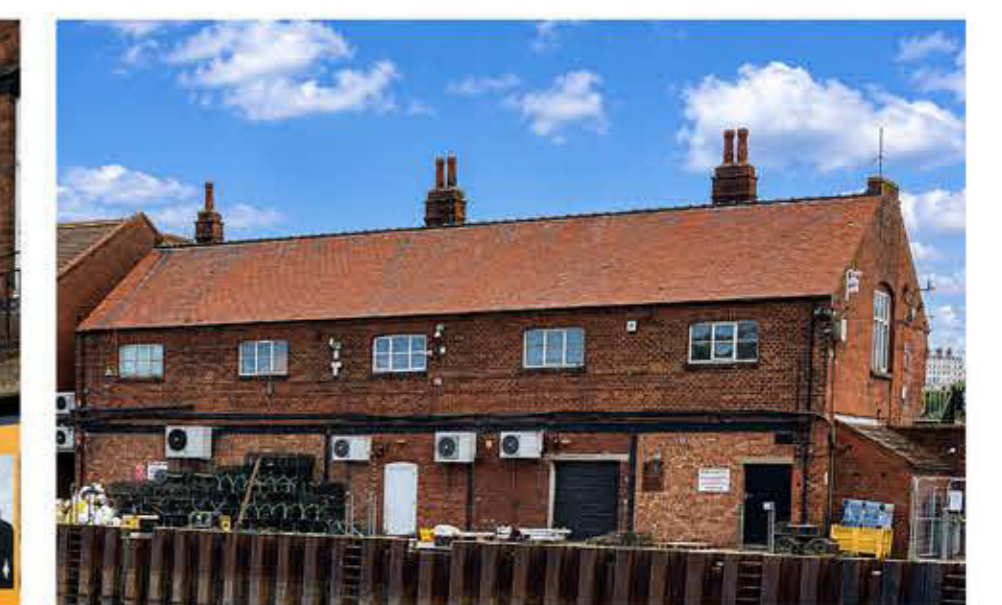
'Building 2' - Google Maps (2026)