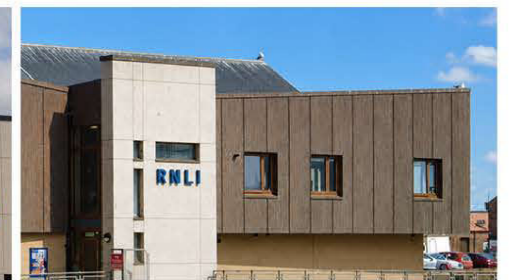
Existing Lifeboat Station - Google Maps (2026)