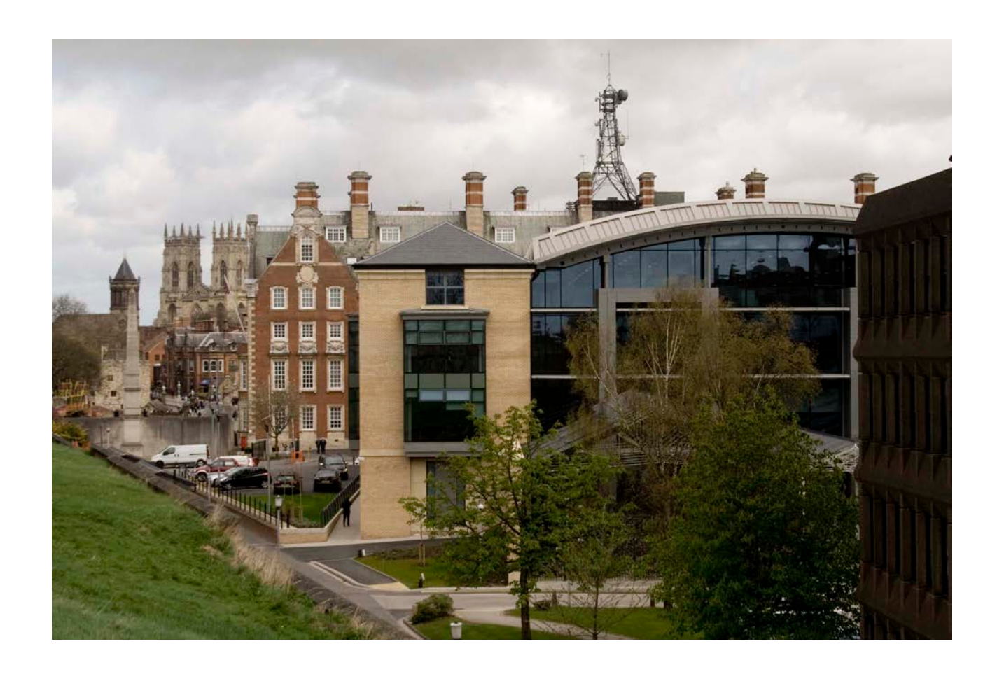
The Minster from the city wall with the converted 1840s railway station in the foreground