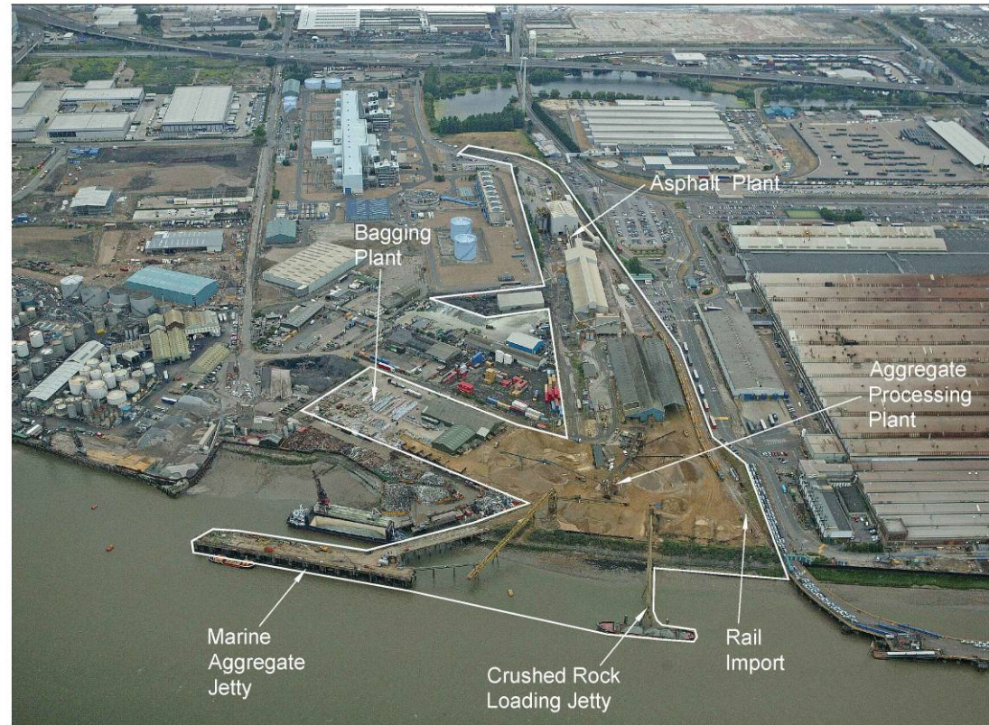
Photograph 9: Hanson UK Dagenham Marine Wharf and Rail Depot a large scale multi-modal facility on the Thames.