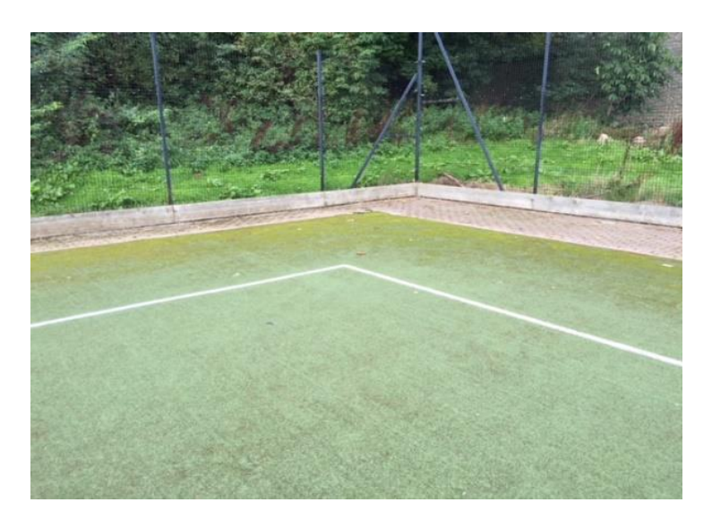
Figure 1.2: The image below illustrates the lines of the pitch lifting, creating a trip hazard.