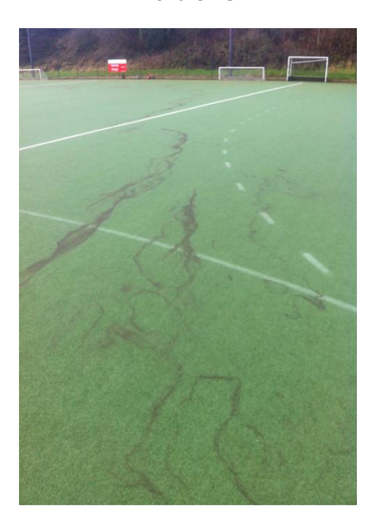
Figure 1.1: The image below illustrates the short pile and moss infestation at the surface of the AGP.