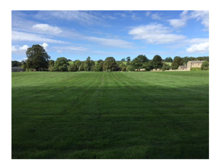
Figure 1.5: The images below show the roots of adjacent trees breaking the surface at the western side of the Lord's playing field.