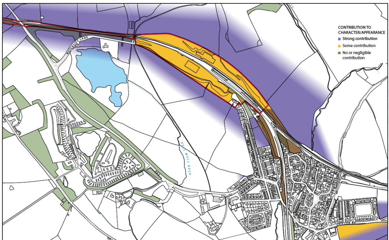
Figure 1, Settle-Carlisle Conservation Area Appraisal - Hellifield area map

Figure 1 shows a map of the Hellifield area and how the methodology has been applied. The Settle-Carlisle Conservation Area is shown on the map bounded by a red line.