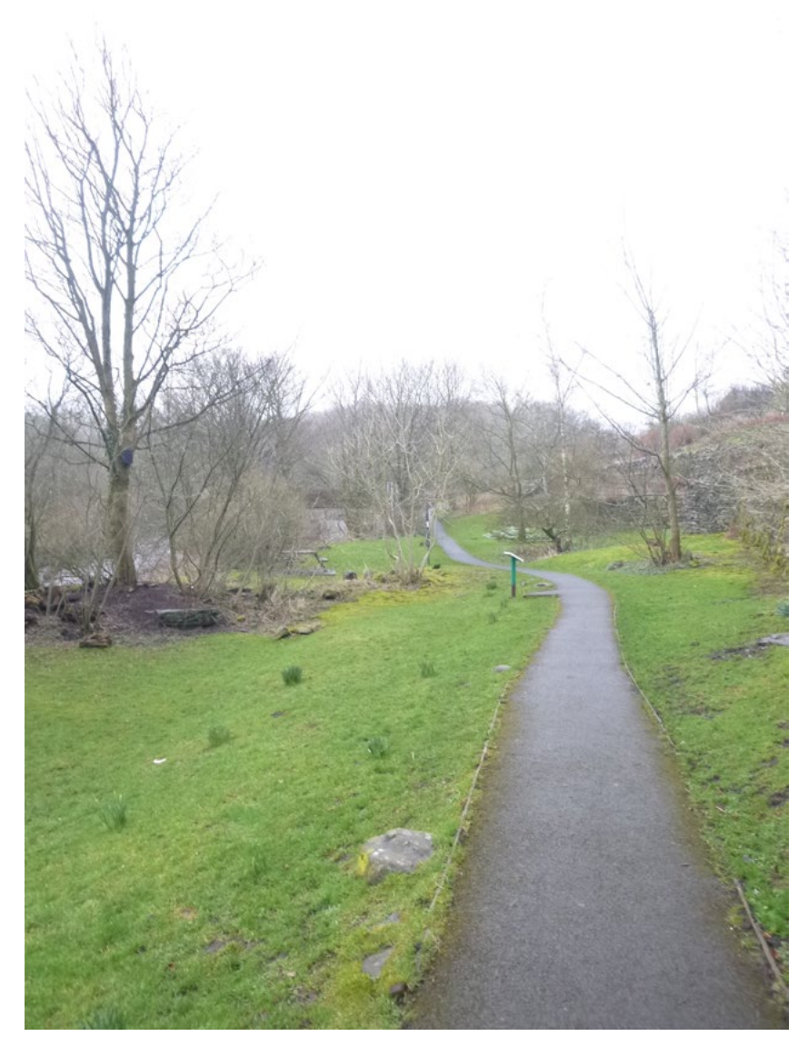
Footpath on the east bank of the River Doe