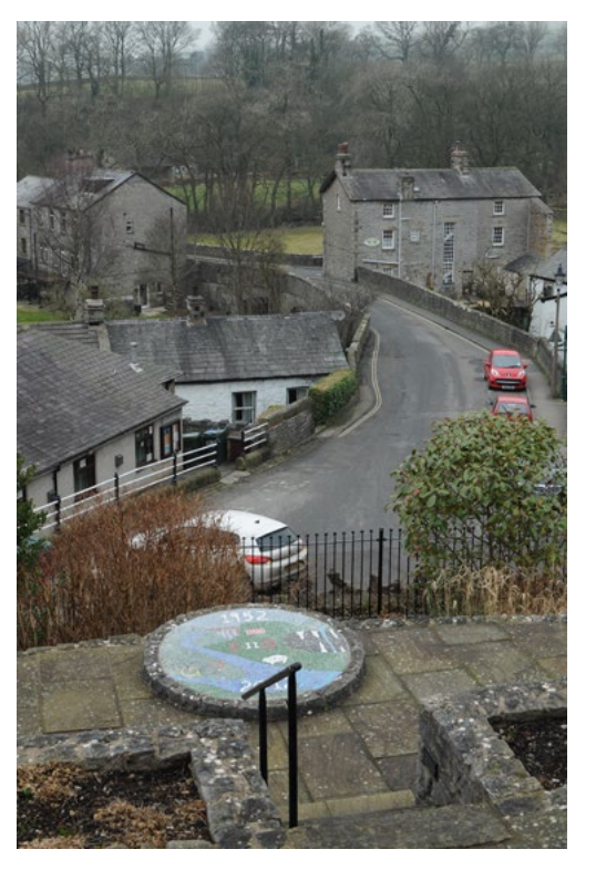
View west across the river valley

Street west across the river valley and the Rivers Doe and Twiss. The view continues to the countryside beyond and is framed by the Church of St Mary to the north-east, which stands on the high ground of the village overlooking the valley, and the viaduct to the south-west.