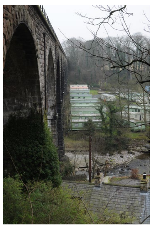
Caravan park in river valley