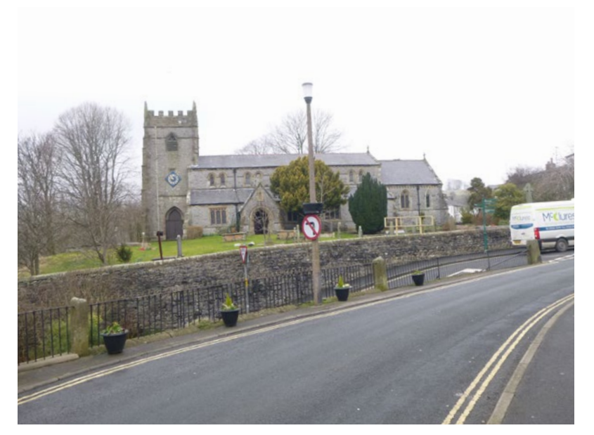
Church of St Mary, Main Street